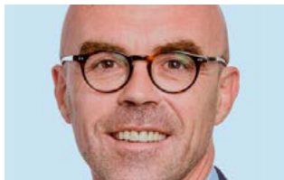
JORGE BUXADÉ MEP