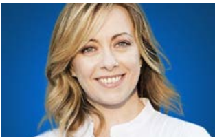
GIORGIA MELONI MP

These values underpin our politics, including our vision for a reformed European Union. Europe stands at a crossroads and the ECR Party's agenda for reform has never been more relevant than it is today. Join our movement, and help us advance a Europe – and a world.