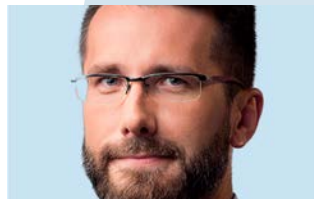
RADOSŁAW FOGIEL MP

Vice President | Law and Justice, Poland