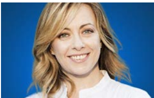
GIORGIA MELONI MP

These values underpin our politics, including our vision for a reformed European Union. Europe stands at a crossroads and the ECR Party's agenda for reform has never been more relevant than it is today. Join our movement, and help us advance a Europe – and a world.