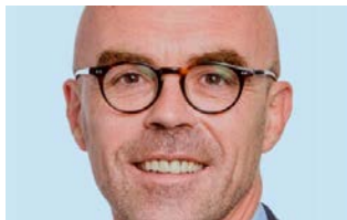
JORGE BUXADÉ MEP