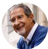
NELLO MUSUMECI Minister of Civil Defence and Marine Policy, Italy