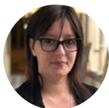
ELENA PAGANA Land and Environment Councillor, Sicily Region, Italy