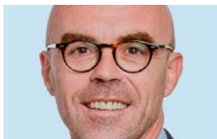
JORGE BUXADÉ MEP