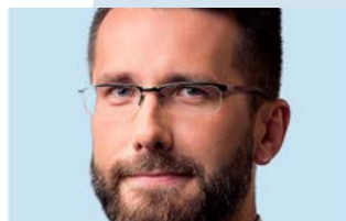
RADOSŁAW FOGIEL MP

Vice President | Law and Justice, Poland