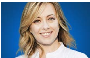
GIORGIA MELONI MP

These values underpin our politics, including our vision for a reformed European Union. Europe stands at a crossroads and the ECR Party's agenda for reform has never been more relevant than it is today. Join our movement, and help us advance a Europe – and a world.