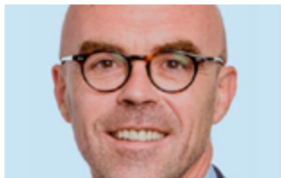
JORGE BUXADÉ MEP