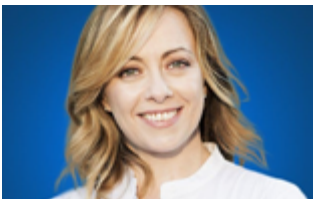
GIORGIA MELONI MP

These values underpin our politics, including our vision for a reformed European Union. Europe stands at a crossroads and the ECR Party's agenda for reform has never been more relevant than it is today. Join our movement, and help us advance a Europe – and a world.