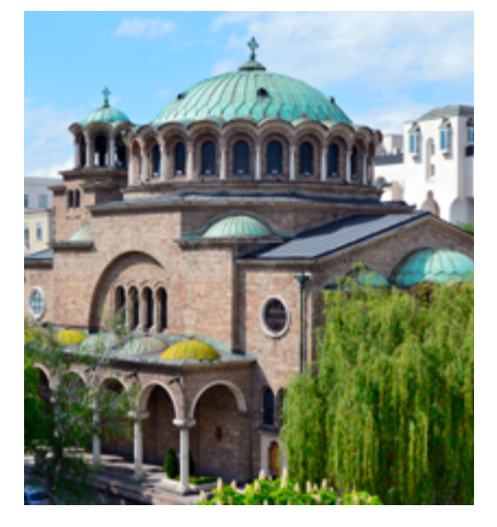
Cathedral church "Sveta Nedelya"