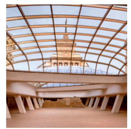
Ancient complex "Serdika"