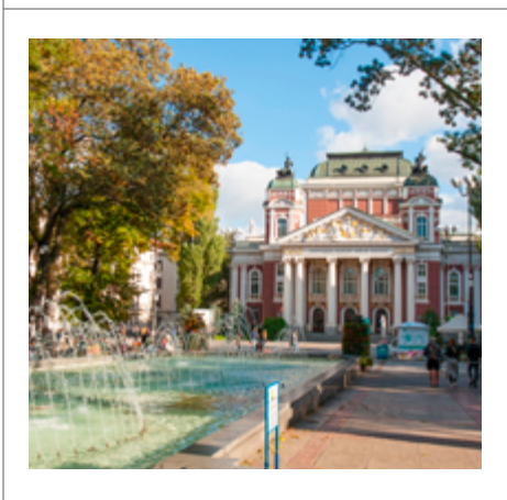
National theater "Ivan Vazov"